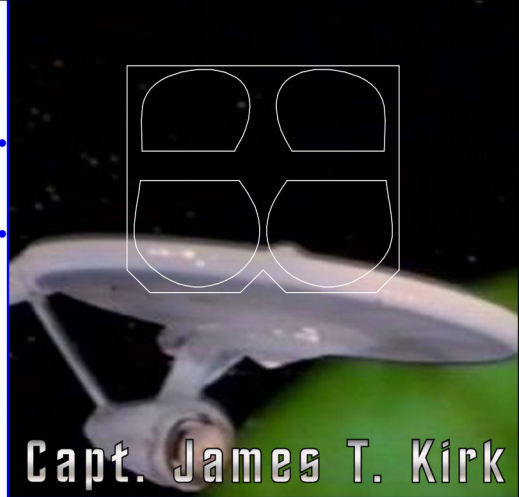
Capt. James T. Kirk